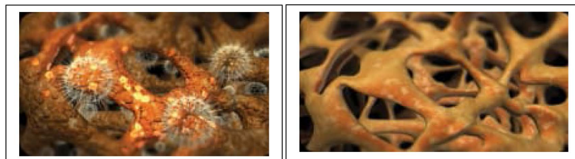
Macrophages at work